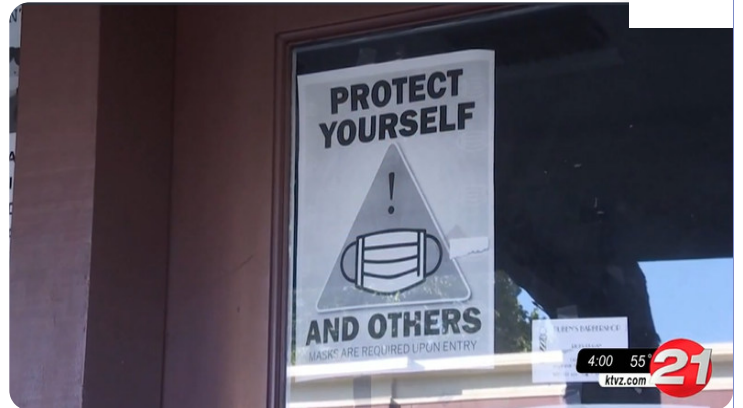
Redmond School Board joins in outcry over proposed 'permanent' indoor mask requirement - KTVZ