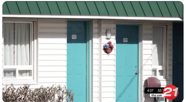
Bend city councilors OK $4.55 million purchase of Rainbow Motel site - KTVZ