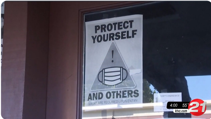
Proposed Oregon mask mandate extension draws fire - KTVZ